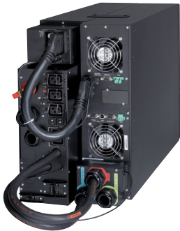
9PX 11kVA with Maintenance ByPass